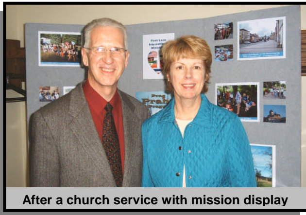
After a church service with mission display

While keeping church giving first, please discuss, pray and decide about joining the 12X120 team.